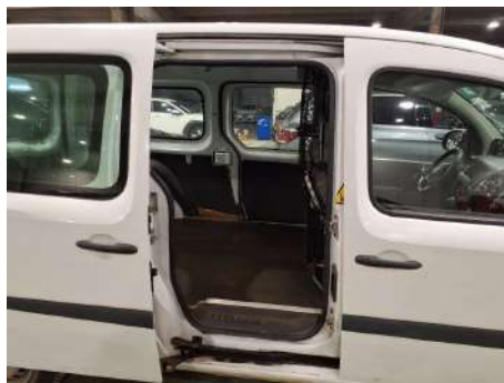
Rear passenger compartment