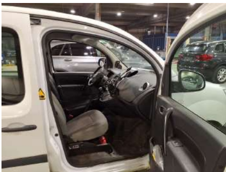
Front passenger compartment