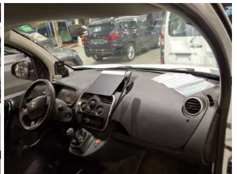
Dashboard from rear seat