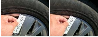
Tyre RL, Out of tolerance, Replace