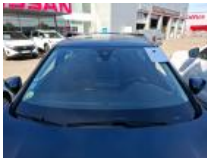
Windscreen, Crack, Replace