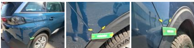
Door RR, Scratch(es), Polish