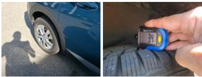
Alloy rim RR, Scratch(es), Repair/replace (lump sum)