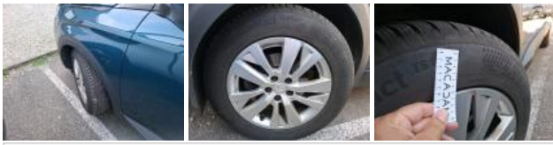
Door FL, Scratch(es), Acceptable