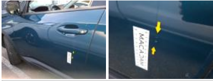
Door RL, Dent(s) and scratch(es), Acceptable