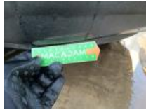
Bumper spoiler Rear, Deformed / Strained, Replace and paint