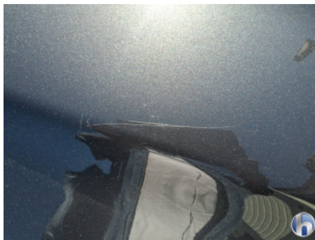
2. Hood Deep scratch - Paint