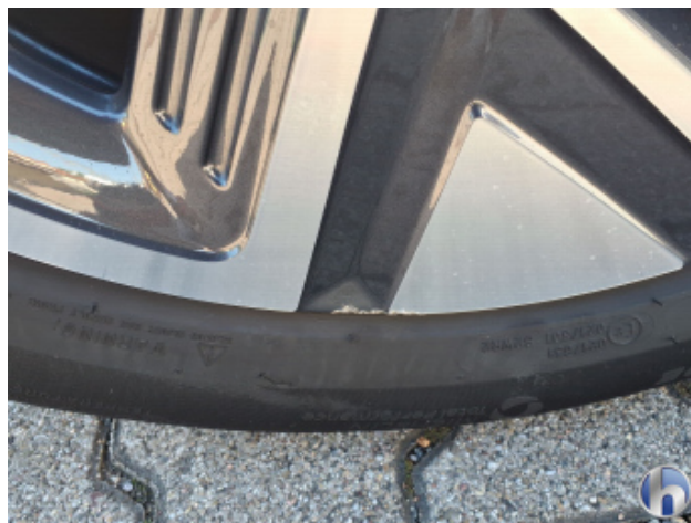
1. Rim front - left Deep scratch - Smart repair