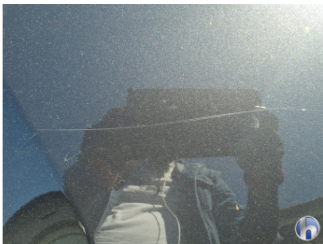
2. Hood Deep scratch - Paint